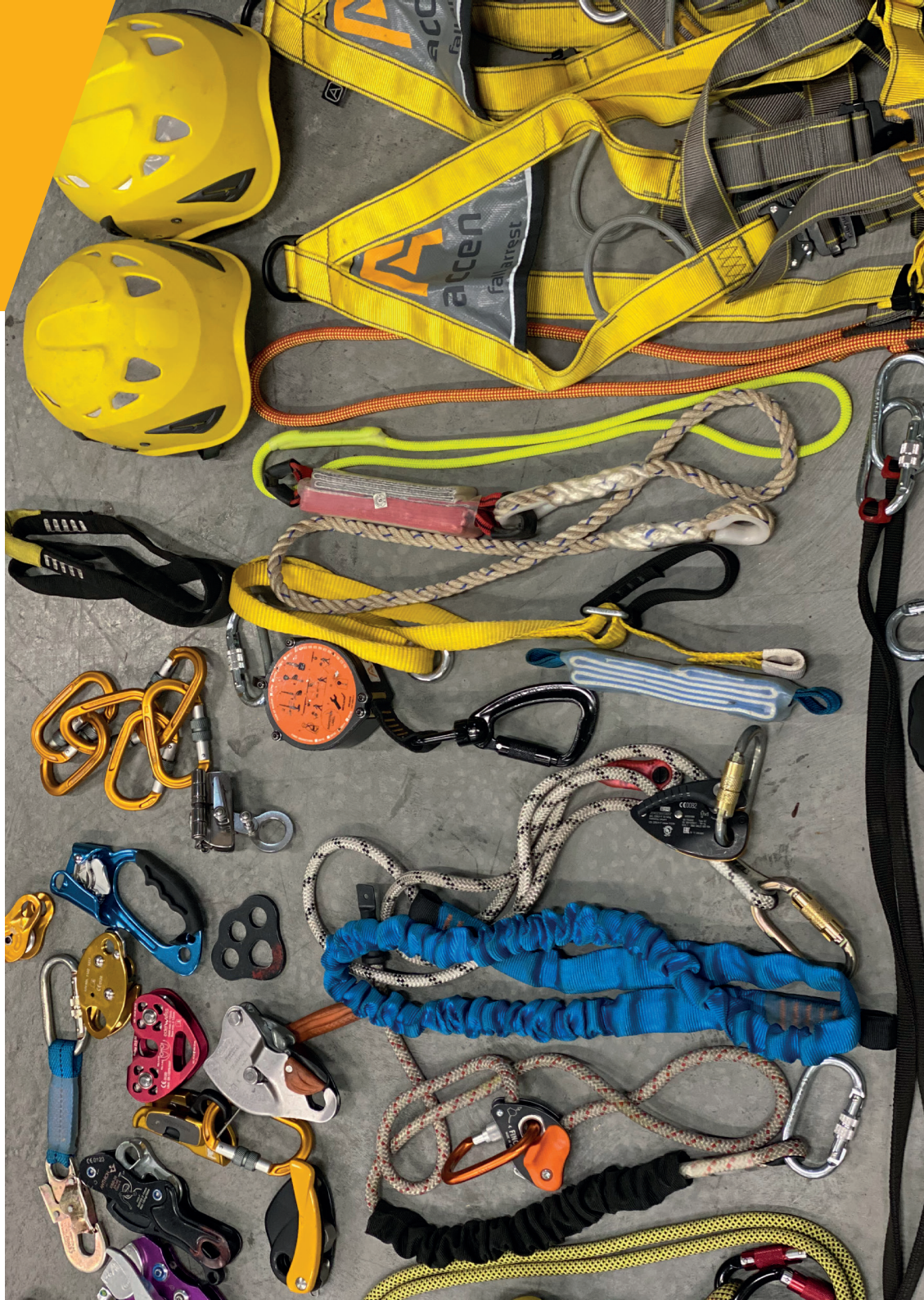
A collection of climbing gear laid out on a grey surface. The items include two yellow helmets, a yellow and grey harness with 'atten fall arrest' branding, several ropes in orange, yellow, blue, and black, various carabiners in orange, blue, and silver, and several belay devices in blue, red, and silver. A black and orange circular device, possibly a compass or a specialized meter, is also visible. The gear is arranged in a somewhat organized manner, showing the different components used in climbing.